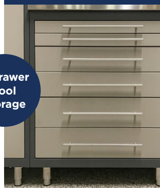
STAINLESS STEEL PULLS