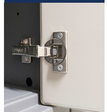
BLUM SOFT CLOSE HINGES