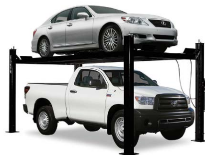
PRO PARK 8PL