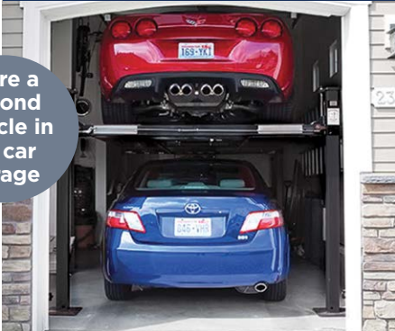
HIGH QUALITY 4 POST LIFT

store a second vehicle in a 1 car garage