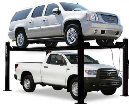
PRO PARK 9S