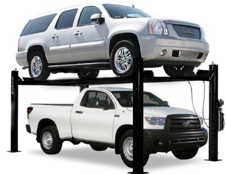
PRO PARK 9S

ask about a high lift conversion to maximize your garage ceiling height