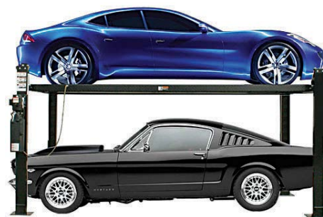
PRO PARK 8S