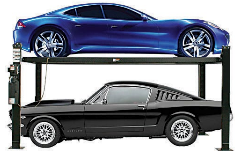
PRO PARK 8S