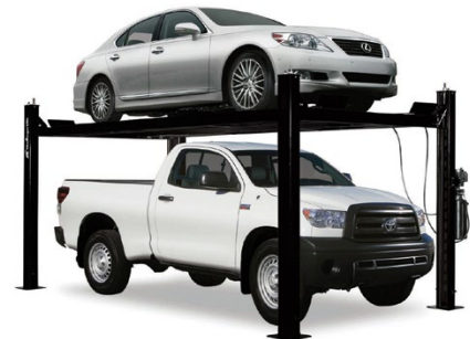
PRO PARK 8PL